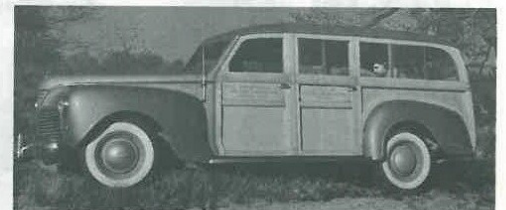
CKLW Radio was mobile back in the 40's