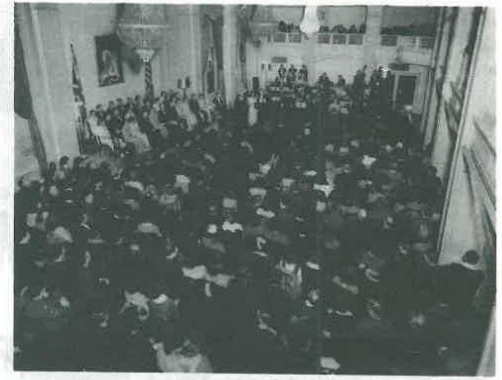
CKLW broadcasts Windsor Federation of Musician Orchestra Prince Edward Hotel Ballroom — 1940