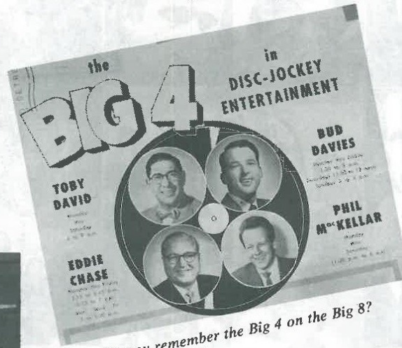
Do you remember the Big 4 on the Big 8?