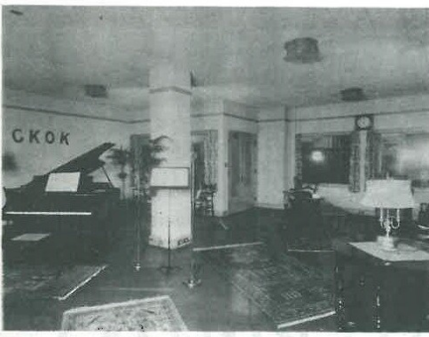
The main studio — CKOK — 1932