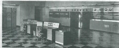
50,000 Watt transmitter building located near Harrow, Ontario — opened 1949